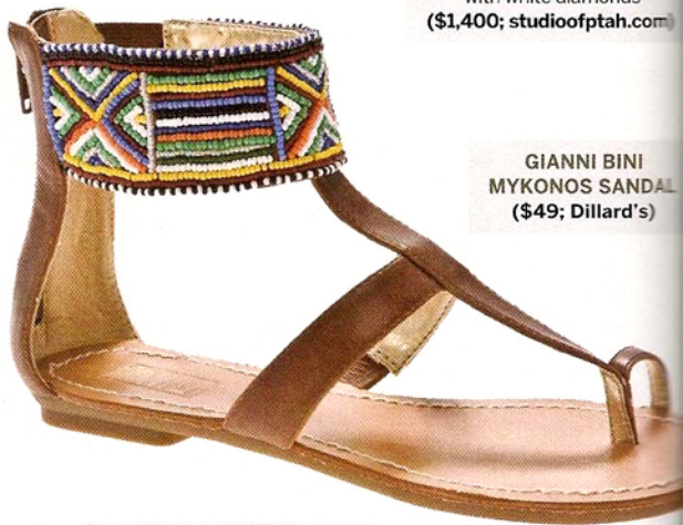
GIANNI BINI MYKONOS SANDAL ($49; Dillard's)