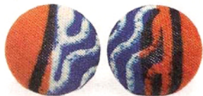
CASA DI CULTURE AYE NIGERIAN BATIK BUTTON EARRINGS ($6; casadiculture.com)