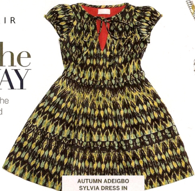
AUTUMN ADEIGBO SYLVIA DRESS IN SENEGALESE FABRIC ($465; autumnadeigbo.com)

On the runway and in the streets, African-inspired fashion is taking over.