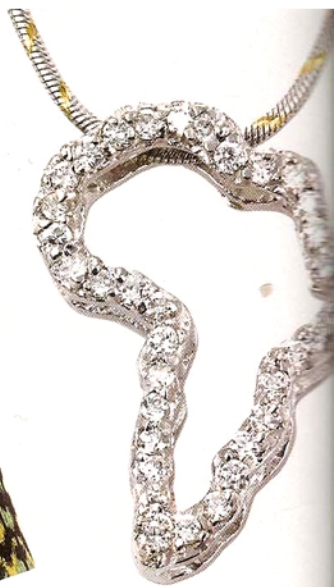
STUDIO OF PTAH AFRICA MAP PENDANT in 18-kt. white gold with white diamonds ($1,400; studioofptah.com)